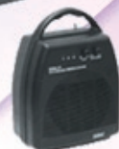
EzVox 310 Wireless Voice Amp