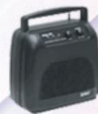
EzVox 210 Wireless Voice Amp